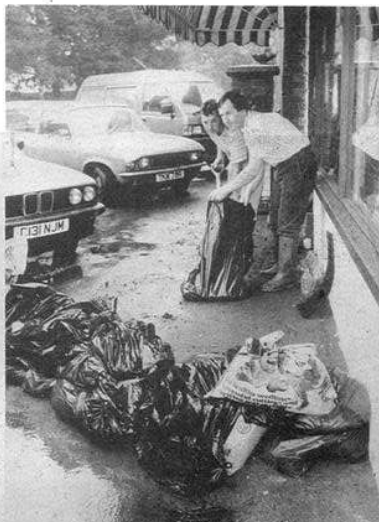
Bags to do in the morning