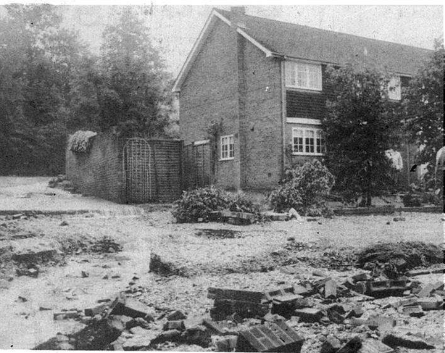
Shattered walls and ruined gardens in battered Aldermaston