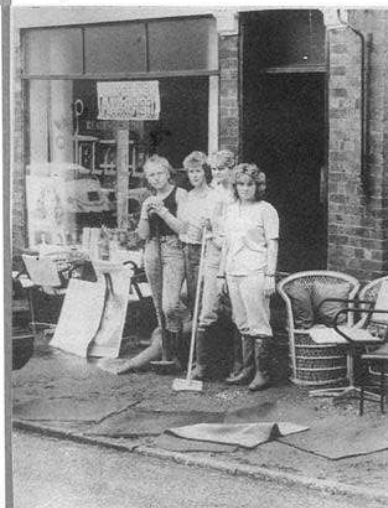
Taking a breather during the clear-up operation