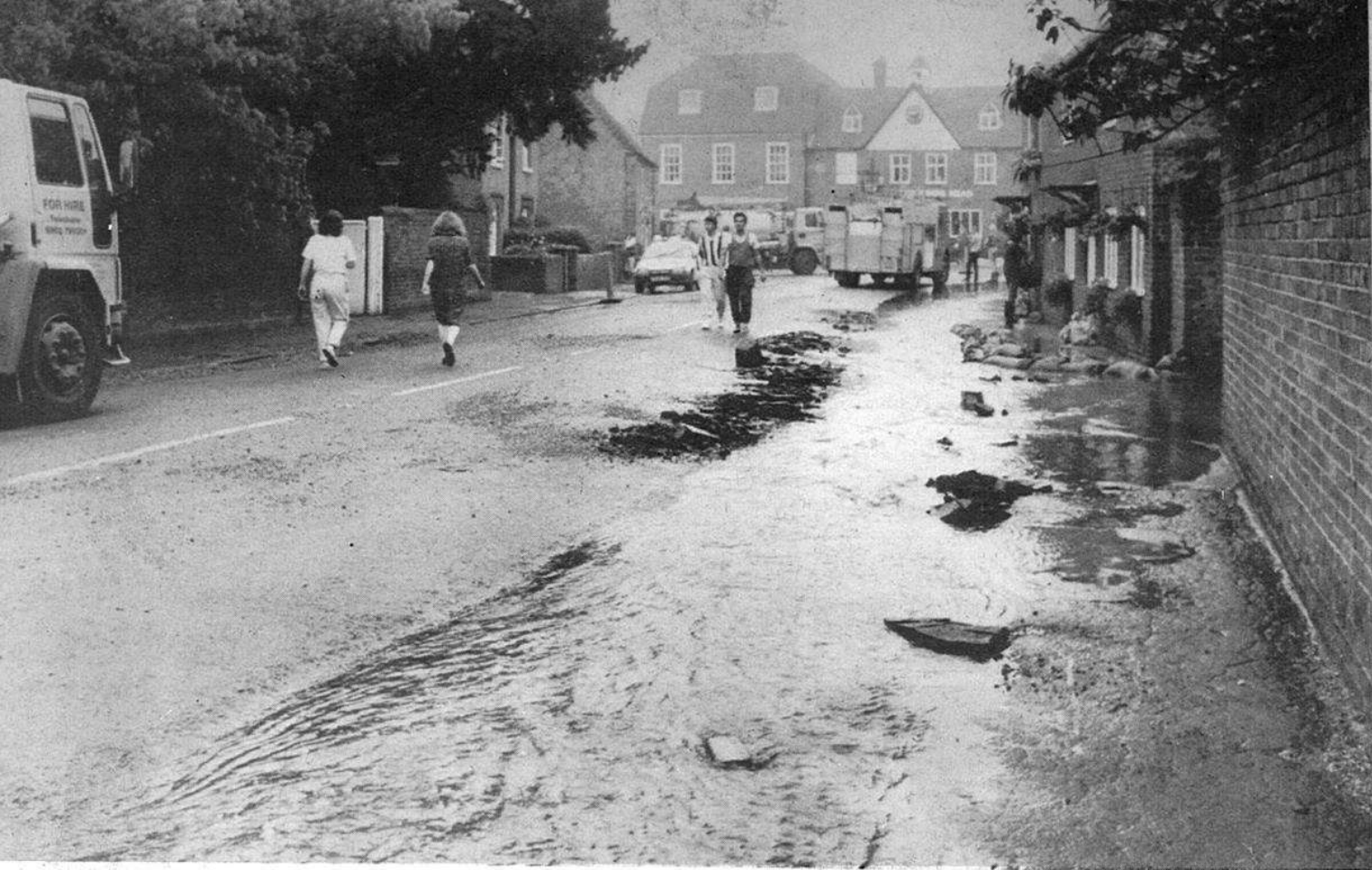
Water still pours through the streets of Aldermaston as residents and emergency workers see the devastation in the cold light of dawn