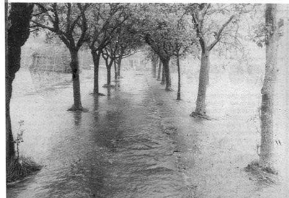
Gardens awash after the deluge