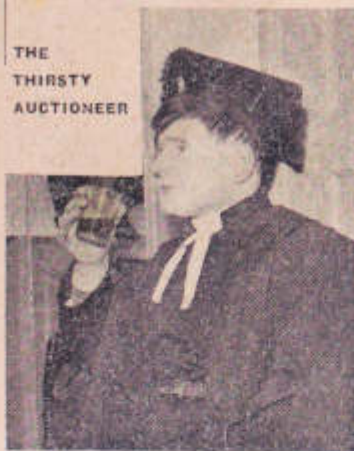
THE THIRSTY AUCTIONEER