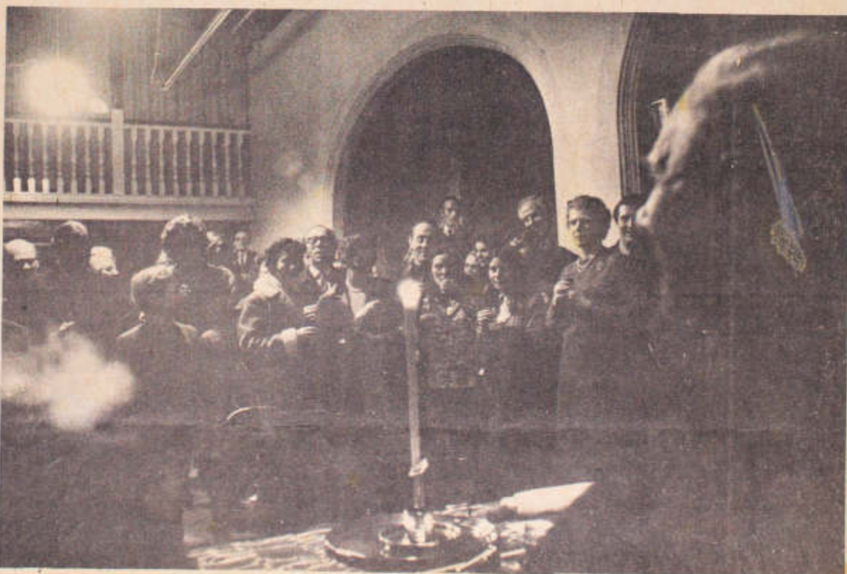
■ The bidders watch as the candle burns down.