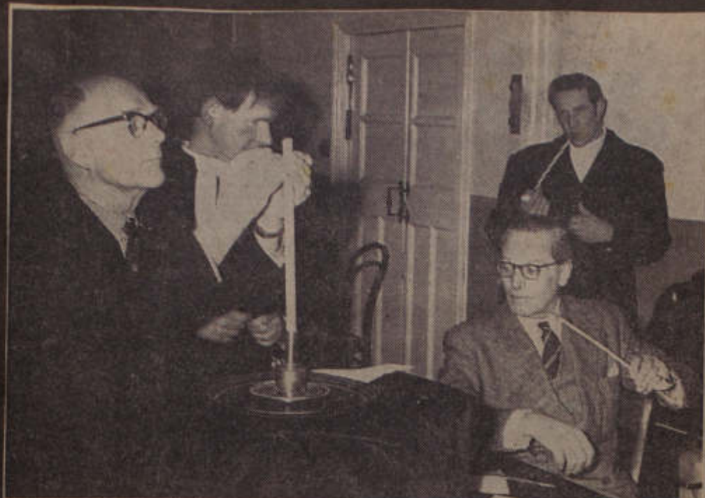
Churchwardens' pipes in hand, spectators at Aldermaston's candle auction watch as the horse-shoe nail is placed in position.